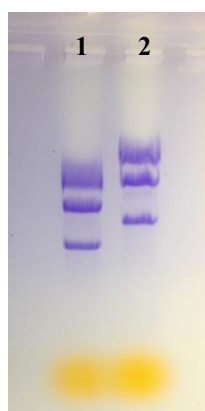
Fig 1. Agarose gel electrophoresis using the gel containing Crystal Violet.

0.8% agarose gel in 1× TAE, 5.5cm x 6.0 cm. The loading volume of each sample is 24 μl.